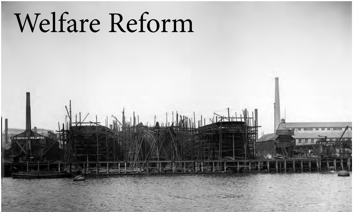
Swan Hunter Ltd. Shipyard c. 1900.